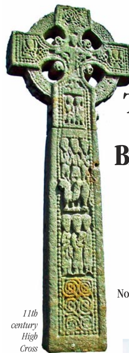
11th century High Cross