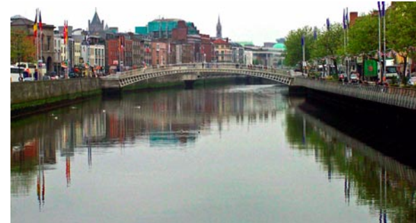
The Ha'penny Bridge in Dublin

of Ireland's leading religious, political and community leaders involved in peacemaking in both the Republic and in Northern Ireland. Hopefully these encounters will reveal the dynamics of peacemaking within a Christian context to our participants and prepare them to become peacemakers in their own churches and communities once they return home to the United States