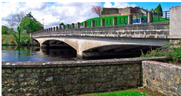
Bridge on border between the Republic of Ireland and Northern Ireland.