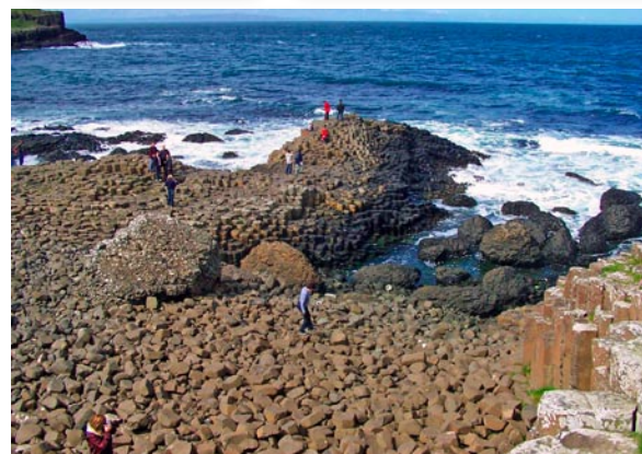
The Giant's Causeway

"If there must in the world, let so that our children