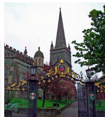
St. Columba's Cathedral