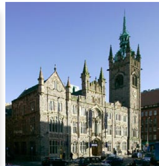
Church House, PCI Headquarters in Belfast