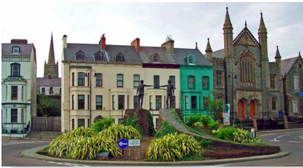
Hands Across the Divide sculpture in Derry